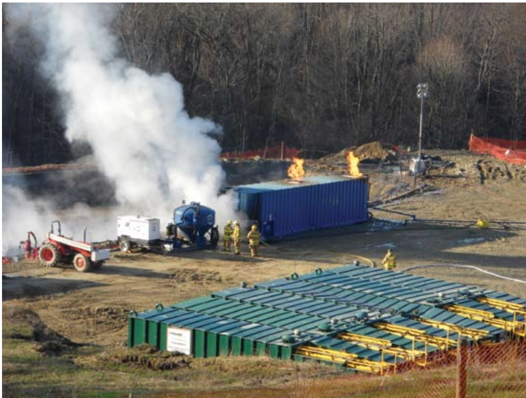
Volunteer firefighters respond to a fire in a wastewater pit at an Atlas Energy Resources well site in Washington County, Pa., in March 2010. Fracking places increased demands on emergency responders, creating new dangers that require additional training, and increasing demands for response to traffic accidents involving heavy trucks.

“A 2011 study of a Marcellus Shale well by researchers with the University of Pittsburgh estimated the cost of site reclamation (including reclamation of retention ponds and repairs to public roads) at $500,000 to $800,000 per well site.”