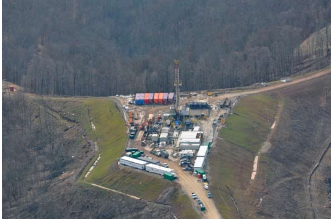
Fracking imposes a range of environmental, health and community impacts. Above, a fracking well site is built in a forested area of Wetzels County, W.Va.

draulic fracturing, to operate that well, and to deliver the gas or oil extracted from that well to market.